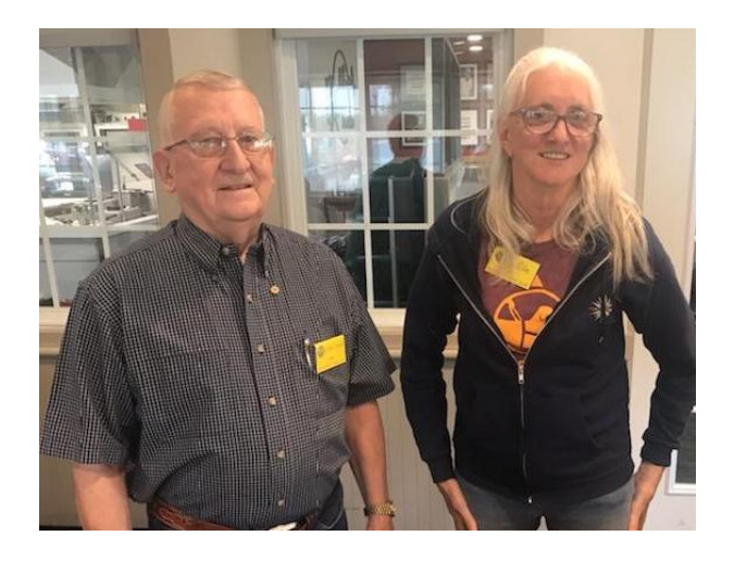
Outgoing President Award